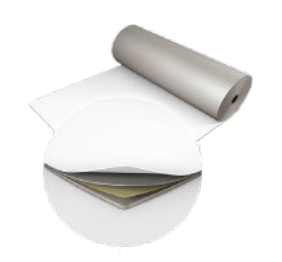
Grey - 880