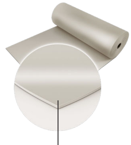
Homogeneous vinyl with support and a slip-resistant dance surface