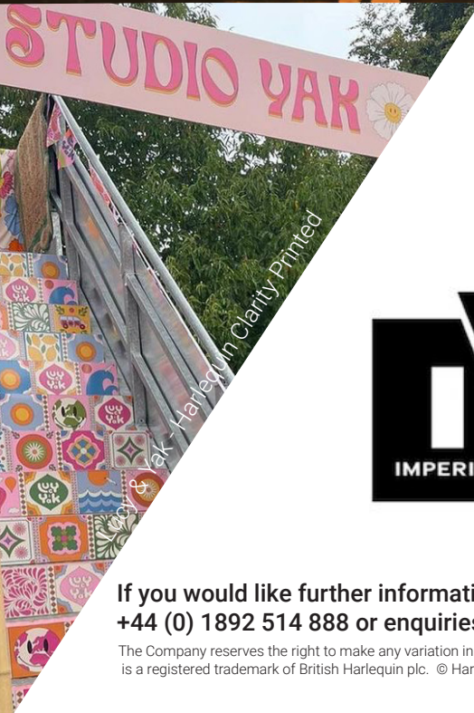
Studio Yak - Harlequin Clarity Printed