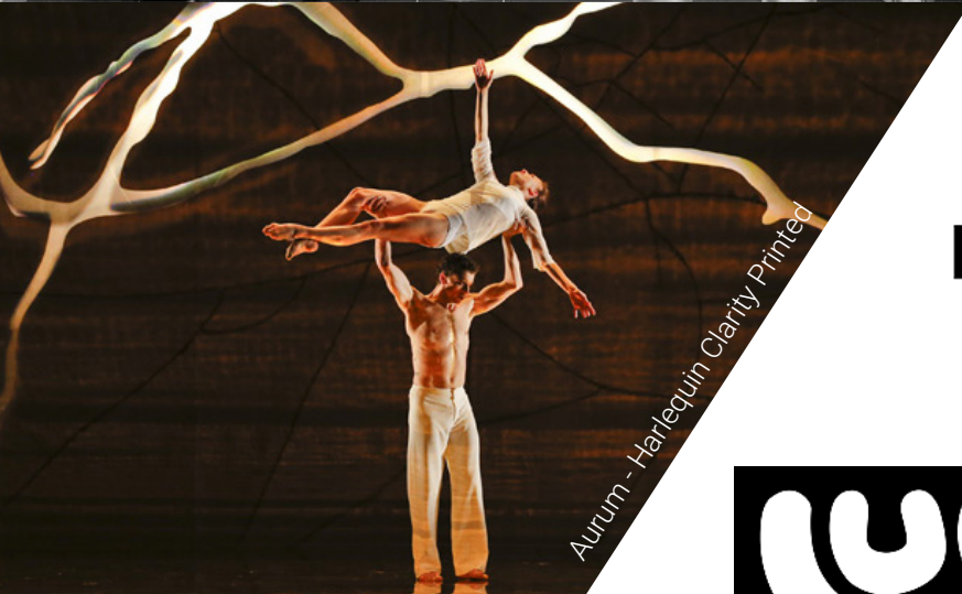
Aurum - Harlequin Clarity Printed