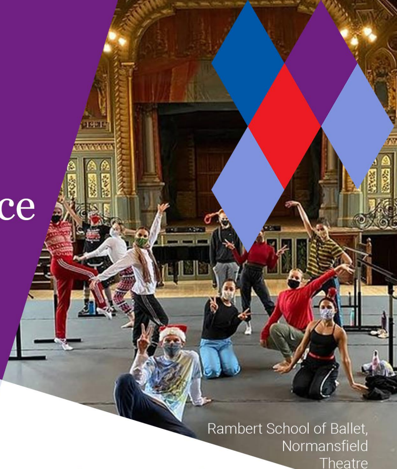
Rambert School of Ballet, Normansfield Theatre

If you would like further information, advice and samples, please contact us on +44(0)1892 514 888 or enquiries@harlequinfloors.com