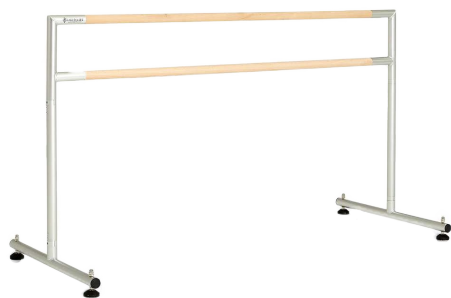
Medium • length of barre 182cm (71.65") • weight (approx.) 12kg