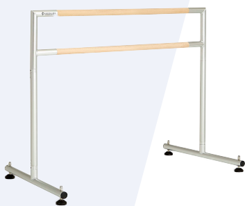
Small • length of barre 132cm (51.97") • weight (approx.) 9kg