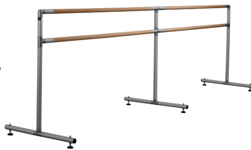
Large • length of barre 360cm (141.73") • weight (approx.) 20kg