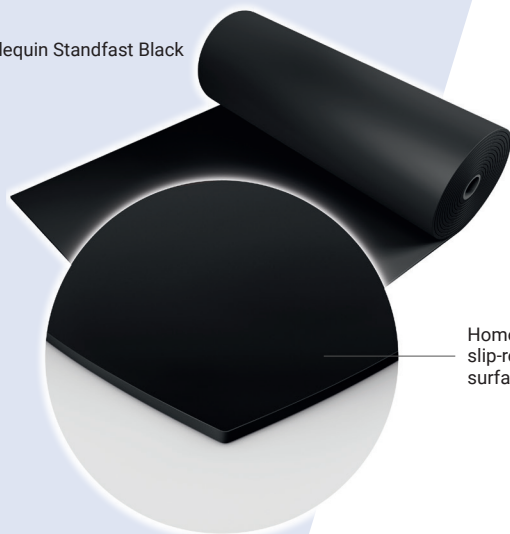
Harlequin Standfast Black