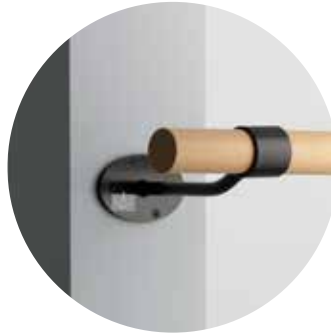
Single bracket black

A comfortable and sturdy barre is essential for warm-up and stretching exercises. Harlequin's extensive range features wall-mounted barres with a variety of single or double bracket designs as well as professional studio quality freestanding barres.