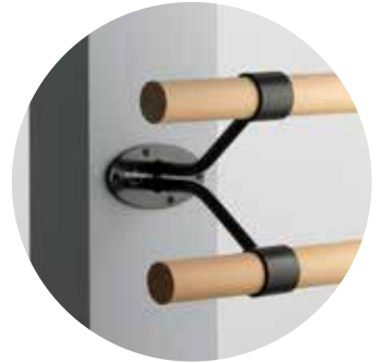
Double bracket black